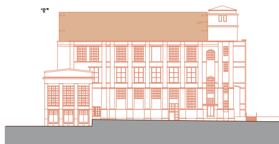
ANSICHT-WEST M 1:200