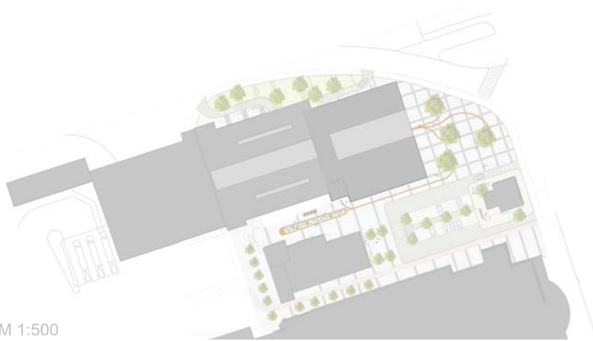
LAGEPLAN M 1:500